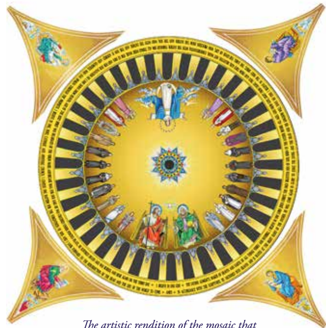
The artistic rendition of the mosaic that will adorn the Trinity Dome.

The Trinity Dome is the central and largest dome of the Basilica. This "Crowning Jewel" will be adorned in mosaic and will depict the Most Holy Trinity, the Blessed Virgin Mary as the Immaculate Conception, and a procession of saints who have an association with America and the Basilica. The Nicene Creed will encircle the base of the dome, while the dome's pendentives will feature the four evangelists: Matthew, Mark, Luke and John. The Trinity Dome will complete the work of the Great Upper Church according to its original iconographic scheme and bring to a close construction of the Basilica of the National Shrine of the Immaculate Conception as it approaches its centennial milestone in 2020.