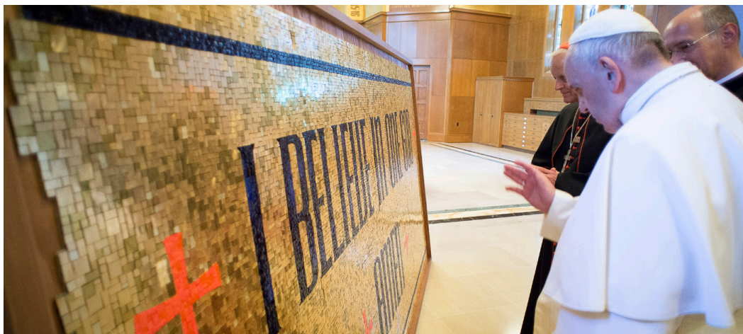
Top: Artistic rendition of the mosaic that will adorn the Trinity Dome. Bottom: Pope Francis blesses the first segment of the Trinity Dome mosaic on his visit to the National Shrine in 2015.