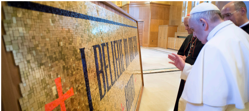
Top: Artistic rendition of the mosaic that will adorn the Trinity Dome. Bottom: Pope Francis blesses the first segment of the Trinity Dome mosaic on his visit to the National Shrine in 2015.