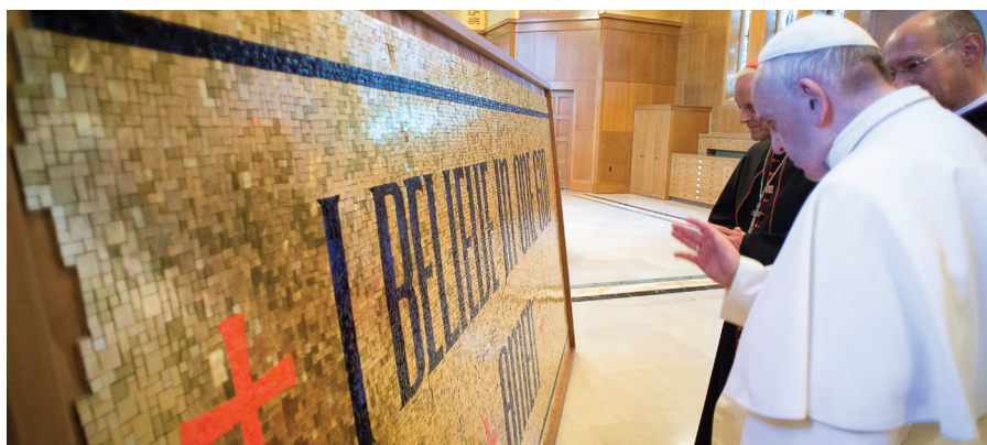
Top: Artistic rendition of the mosaic that will adorn the Trinity Dome. Bottom: Pope Francis blesses the first segment of the Trinity Dome mosaic on his visit to the National Shrine in 2015.