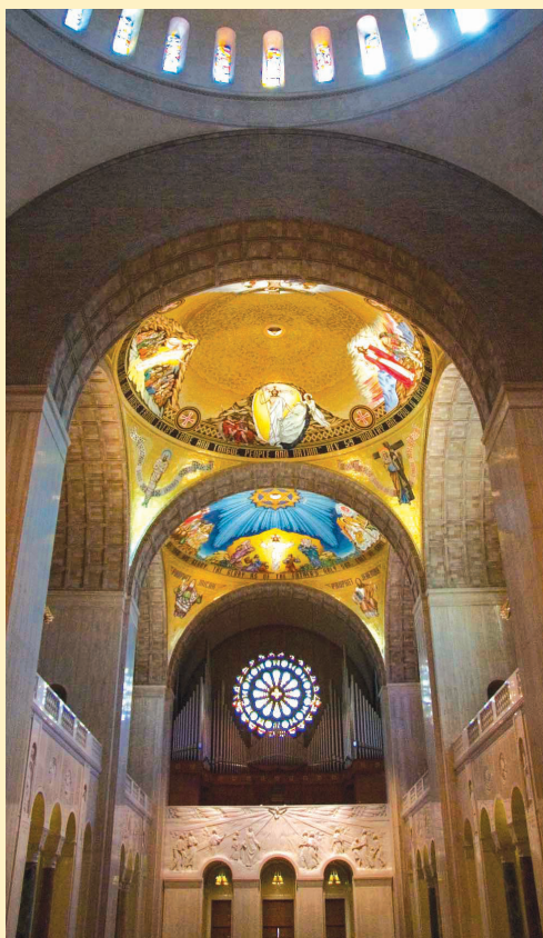
The nave domes of the Great Upper Church.

The Trinity Dome, five times the size of either the Redemption or Incarnation Dome, will also be five times as expensive. We have begun fund raising endeavors and welcome any assistance friends of Mary’s Shrine might be able to provide. ❖